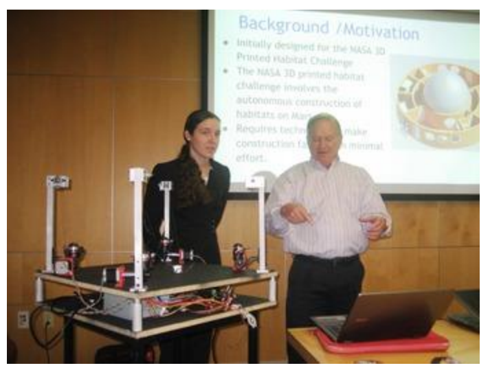
Paul Street shares enthusiasm for the additive technology potential at construction sites